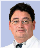
Béla Merkely (Hungary)